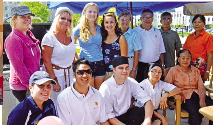
Junior Achievement Tech Camp Open House was held at the Communitech Hub in the Tanner building.